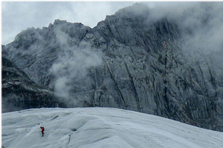
Left over glacier near Base Camp