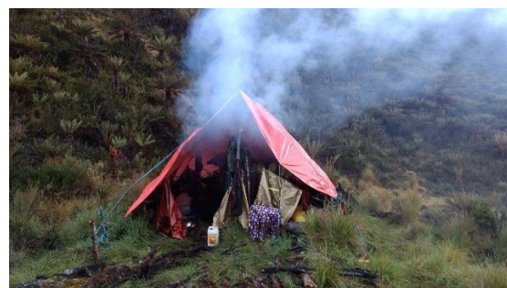
A typical day of camping