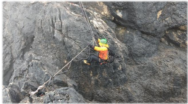
Working hard on the fixed ropes