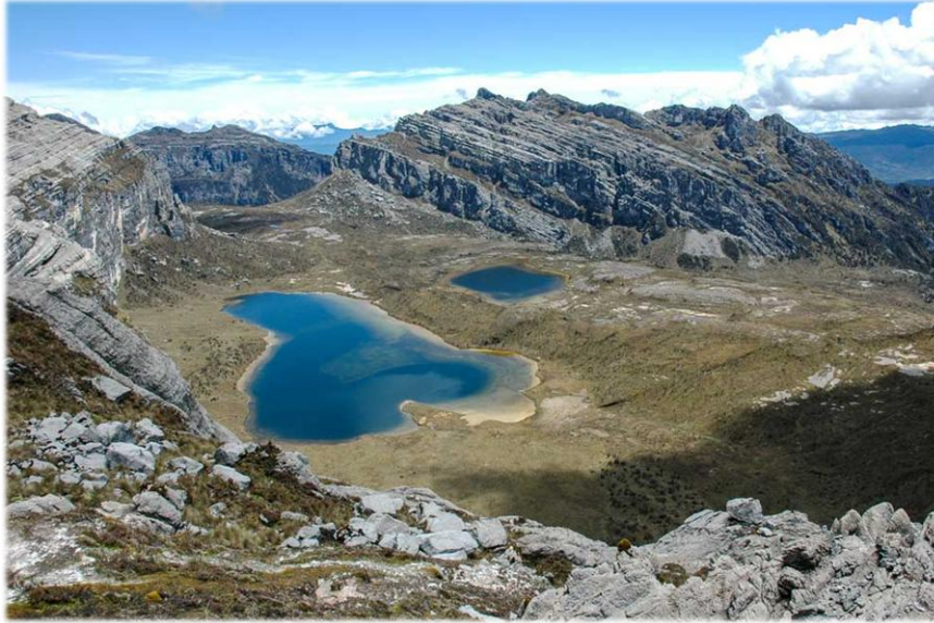
The Meren Lakes