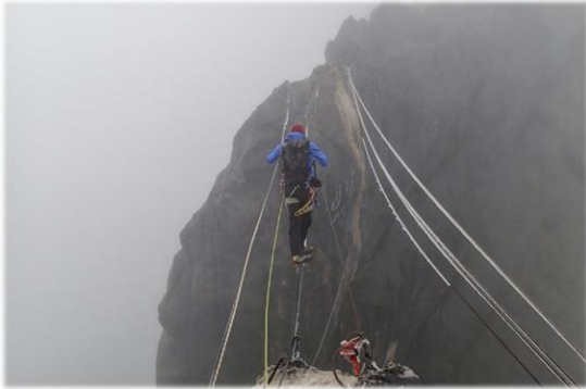
Rope bridge near the summit

Full day of trekking/mountain climbing. Accommodation: tent. Meals: full board.