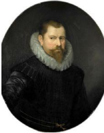
Imaginary portrait of Jan Carstensz; there is no known portrait of this amazing explorer