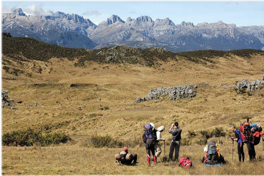
The papua highlands with the mountains in the distance

Carstensz referred to the snow-covered peaks of the mountains of New Guinea which we now know as Puncak Trikora, Puncak Yamin and Puncak Mandala. And of course the highest of them, the one that now bears his name, the Carstensz Pyramid (Puncak Jaya).