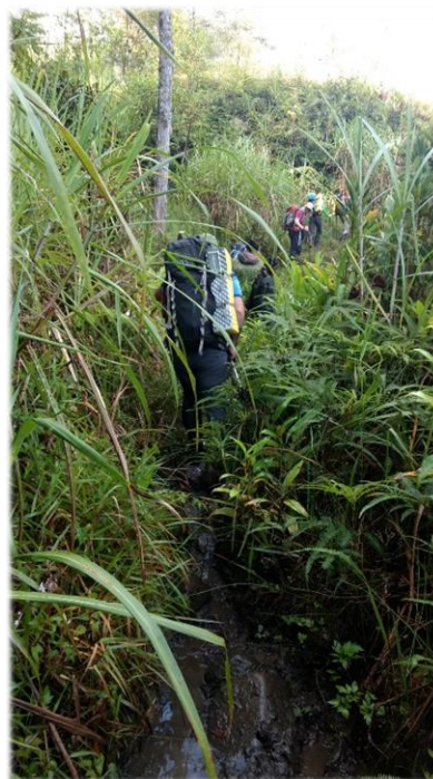
Dense jungle during the 1st day of trekking