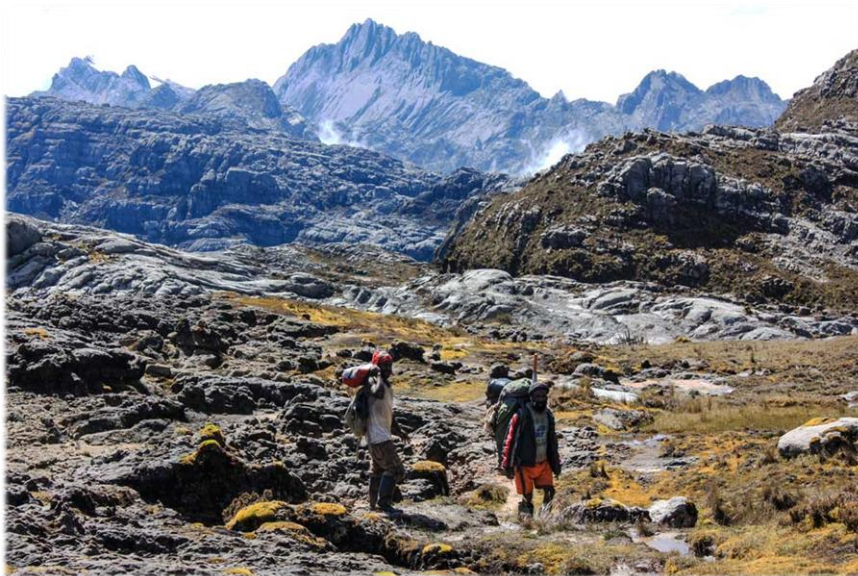
Porters During the trek

Full day of trekking. Guide, porters and cook included. Accommodation: tent. Meals: full board.