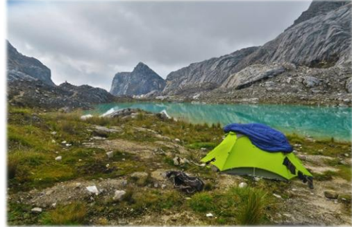
Pitoresque Base Camp next to the lake